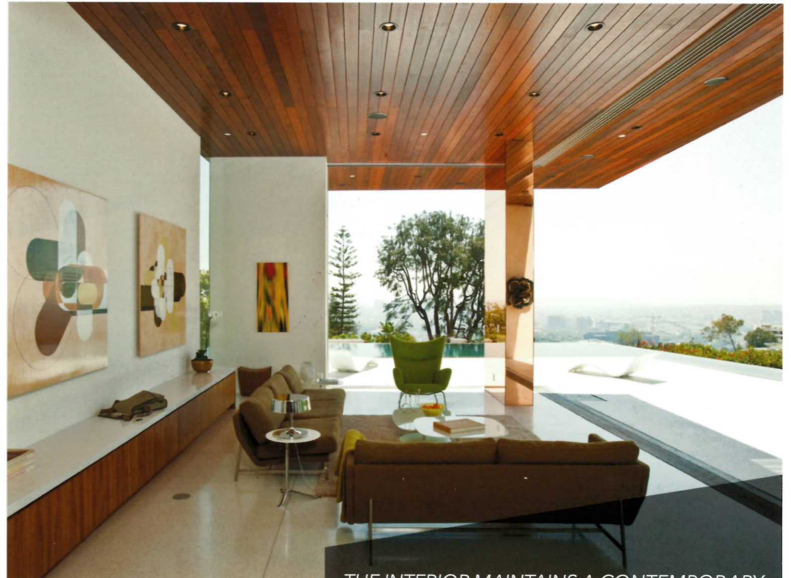
THE INTERIOR MAINTAINS A CONTEMPORARY DÉCOR WITH INTERESTING ARTWORKS HUNG ON THE WALLS TO ADD CHARACTER.

The upper level of this expansive dwelling accommodates spaces that are more private to the residents like bedrooms and bathrooms. The bedrooms are organised in simple, clutter-free fashion to keep in line with its modern design and to not obstruct the stunning view from a high vantage point. The master bath is clad in limestone flooring and walls, glass enclosed double showers and a bathtub furnished with sustainable wood overlooking the verdant trees.