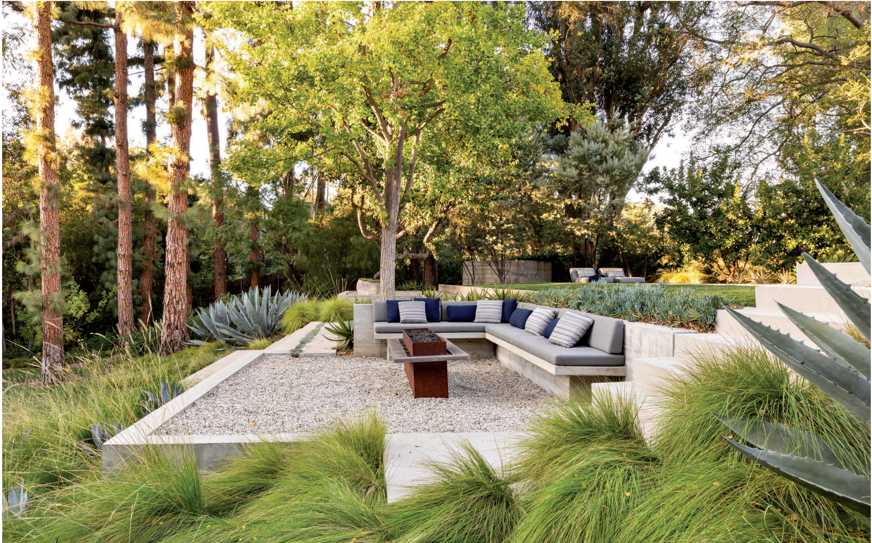
Fiore teamed with builder Eric Dobkin to design the home's welcoming fire pit and seating area, which occupy the landing between the pool level and lower lawn. The custom charcoal cushions and navy pillows feature Sunbrella fabrics, accented with additional pillows in Élitis' Lontano pattern.