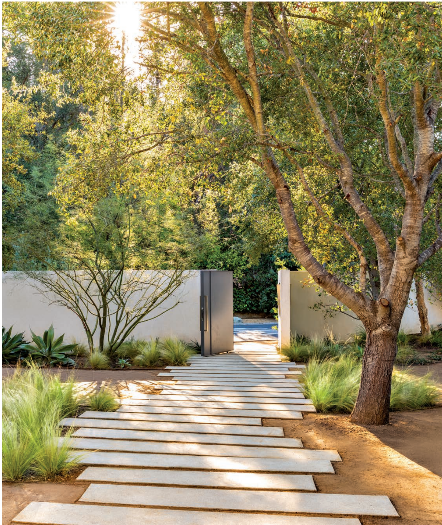
To set the stage from the second you set foot on this renovated midcentury modern home's rolling grounds, landscape architect Michael Fiore created an asymmetric pathway of cast-in-concrete stones. "We wanted it to meander but we didn't want any curving shapes," he notes.